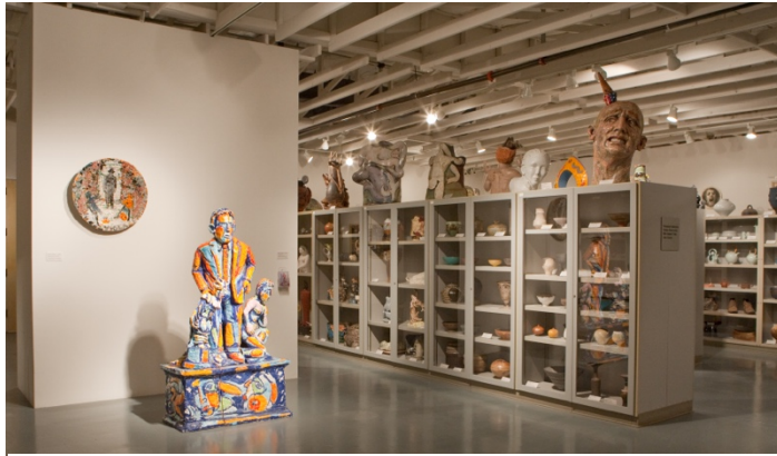
ASU Art Museum Ceramics Research Center