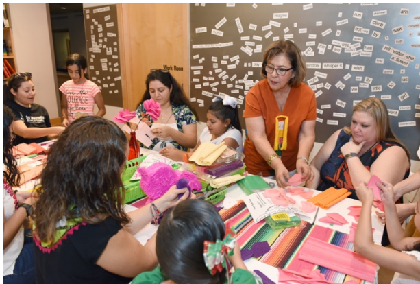
Mexican Independence Day celebration, 2019