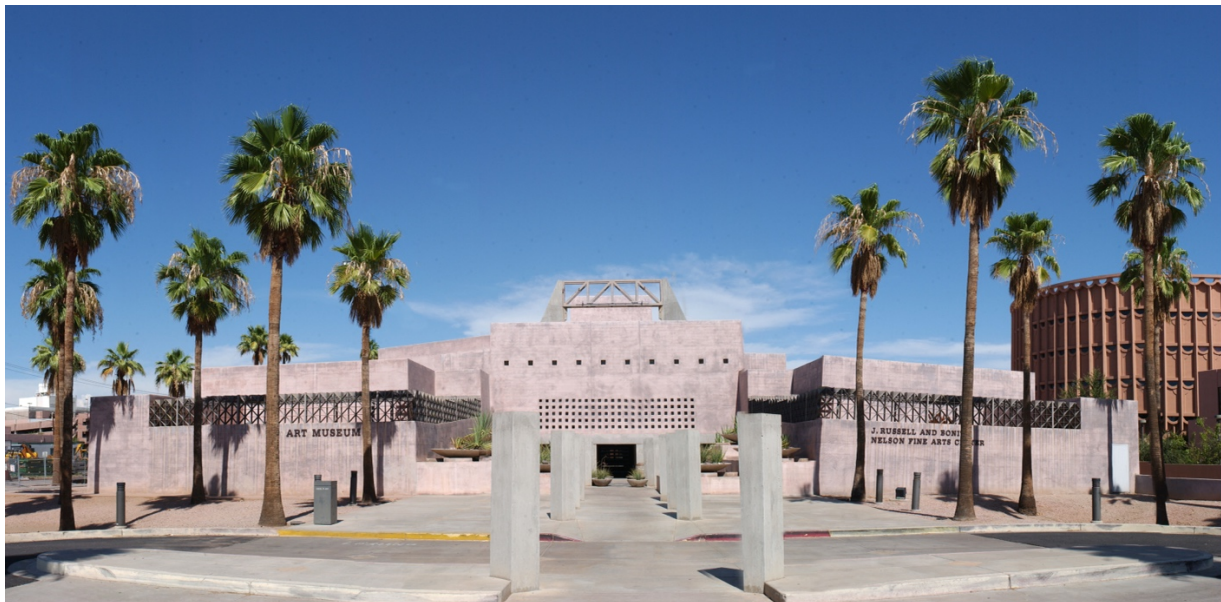
Nelson Fine Arts Center, ASU Art Museum entryway, 1989