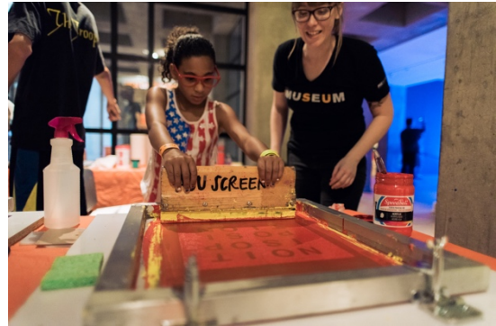
Family Day printmaking workshop with ASU Art Museum Ambassador and the ASU School of Art Print students

The museum launches the popular Summer Family Day in 2000. When Phoenix's climate makes it difficult to be outside, activities are set up throughout the galleries for children and families. Art making projects and performances revolve around current exhibitions and most are led by exhibiting or local artists. The annual program continues through 2018, when the museum begins Creative Saturdays, seasonal family days and opens the permanent workshop space to provide participatory experiences on an ongoing basis for visitors.