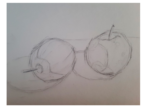
Then, map out the light (highlights) and dark areas (shadows).