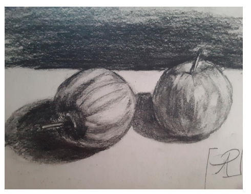
Continue building values until you're done!