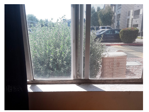
Find a well lit space.