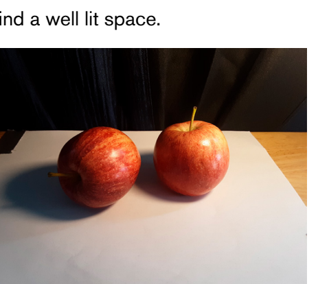
Use a lamp to adjust lighting on the object(s).