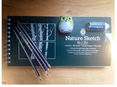
Gather your materials.