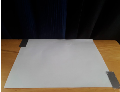
Set up your still-life background.