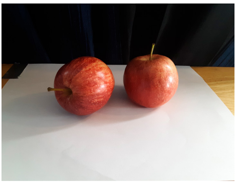
Arrange your object(s).