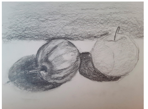
Build up the shapes and values in layers.