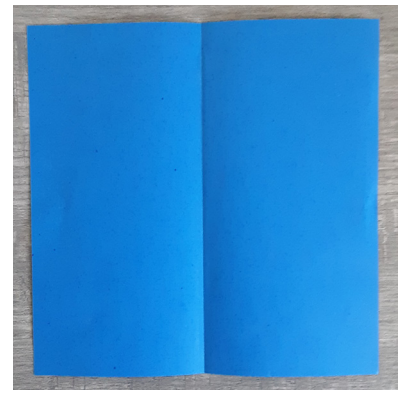
Fold your paper in half. Make sure it is long-ways if you're making it with construction paper.