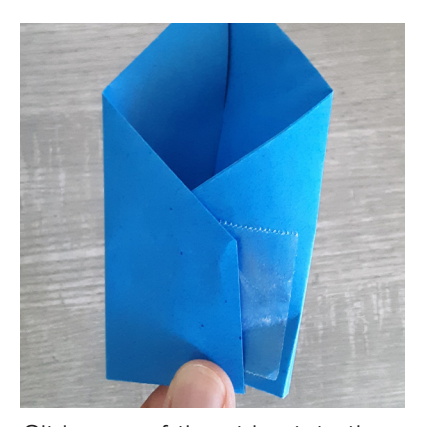
Slide one of the sides into the other, and add tape or glue to hold it in place.