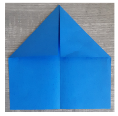
Fold the top corners of the paper toward the center to form two triangles.