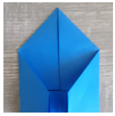
Fold the flat edges of the paper towards the middle line.