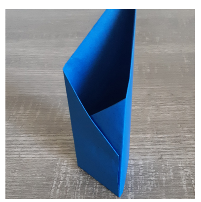
Repeat steps 2–6 five more times to make more compartments for your pencil holder.