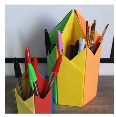
That's it! Have fun making your pencil or pen holder!