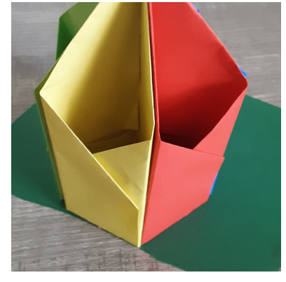
Put glue on the bottom of your new pencil holder to attach it to your last piece of paper. Let it dry, then cut the excess paper off.