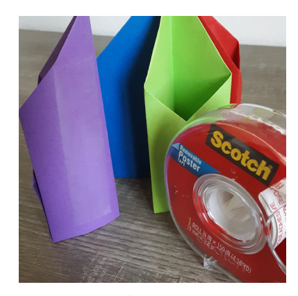
Attach each folded piece to the other ones with glue or tape.