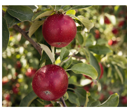
Apple Tree (Malus domestica) See, "Heavy with Love" 2003.