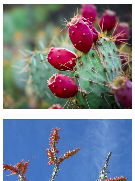
Prickly Pear Cactus (Opuntia)