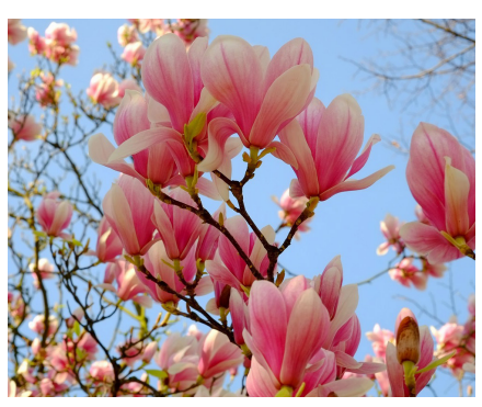
Magnolia (Magnolioideae) See, "Undressed Magnolia" 2003.